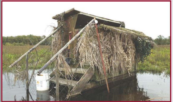
Before and After Pictures of Blind #13 at the Ridgefield National Wildlife Refuge (NWR)