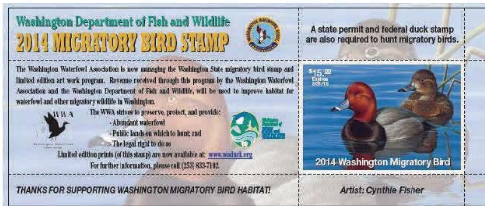
Type G Mini-sheet